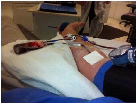
Below: AmeriCorps Members with the Program help to coordinate blood drives across rural Southern and